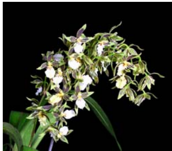
Odontoglossum asthrantum CHM/AOS 84 pts