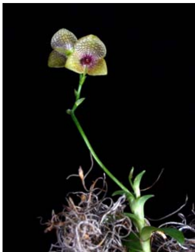
Telipogon intis CHM/AOS 83 pts.