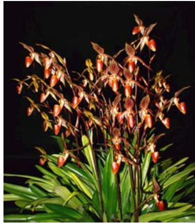
Paph. Susan Booth 'Yumi' CCE/AOS 90 pts.