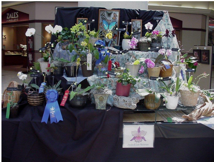
Luis and Paula Matienzo (STOS show 2005)

Or have your own exhibit with very few plants