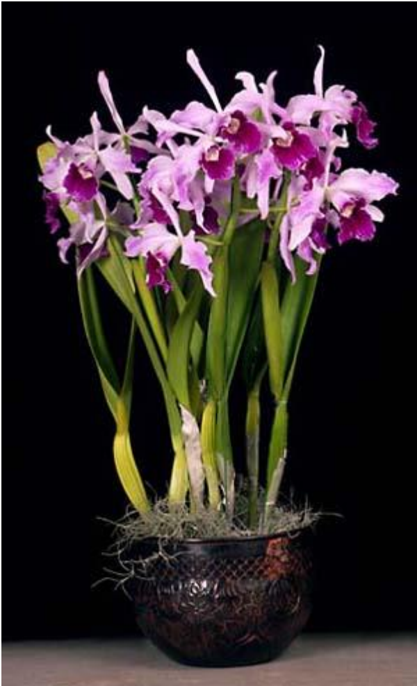
Cattleya purpurata , formerly in the genus Laelia , is without a doubt one of the most stately orchids to bloom in this season.

month, they have still not built up sufficient momentum to be significantly slowed by your missing a day or two of watering owing to dark weather. As always, it is safer to err on the dry side than on the wet. It is important, though, especially to the summer bloomers. Too much shade will cause rapidly developing inflorescences to droop unattractively.